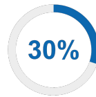
Case Study 2

Successfully launched a new product line, resulting in a 30% revenue increase within the first year.